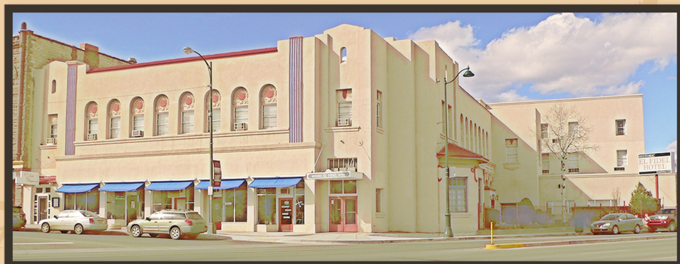
OUR OFFICE AT THE HISTORIC EL FIDEL HOTEL IN LAS VEGAS, NM